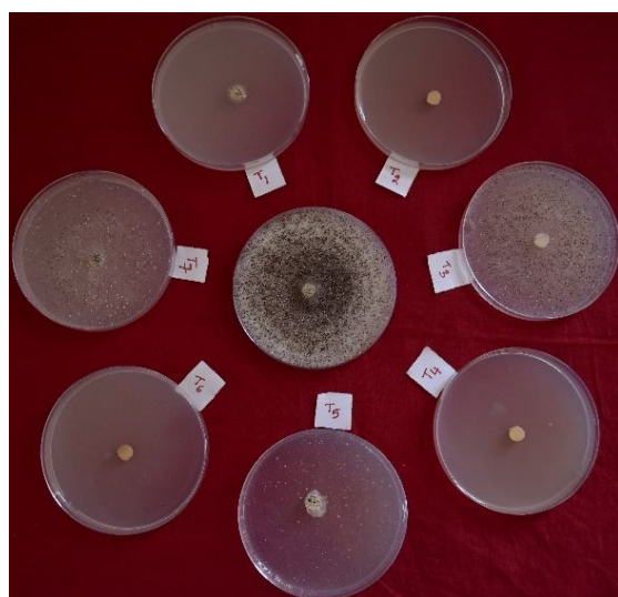
Half recommended dose